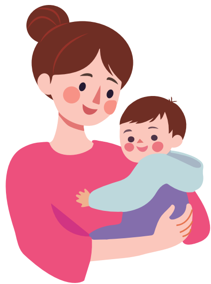
Lactation Questions and Concerns