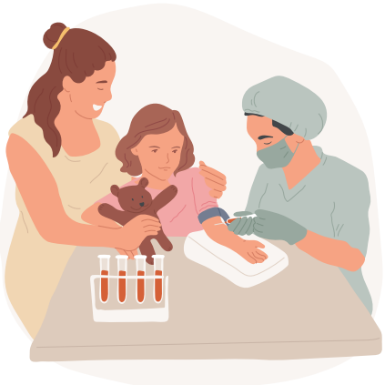
Blood draws and other lab work

*Make sure you check with your insurance, as each one is different!