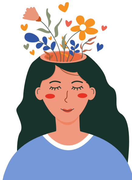
Anxiety, depression & mental health questionnaires