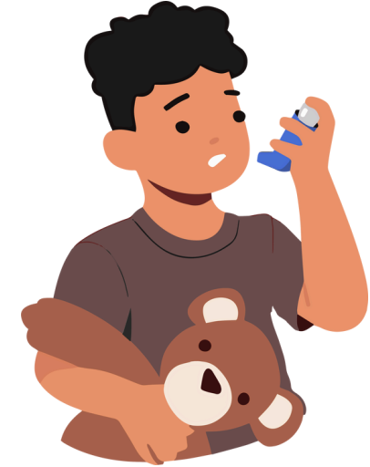
Talking about chronic conditions (asthma, ADHD, & more)